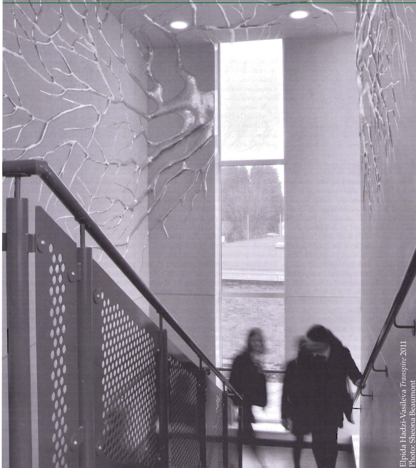
Elpida Hadzi-Vasileva Transpire 2011

Sheona Beaumont on new art for Catholic schools 16