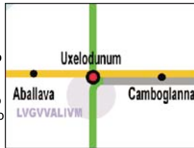
A map of Hadrian's Wall is based on the Tyneside metro

He said: "It's very poor, my Latin - it's alright when I've sat here and had a few beers."